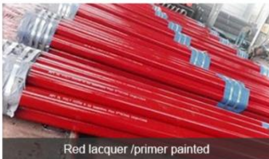
Red lacquer /primer painted