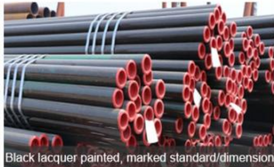
Black lacquer painted, marked standard/dimension