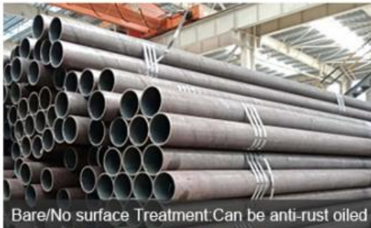
Bare/No surface Treatment: Can be anti-rust oiled